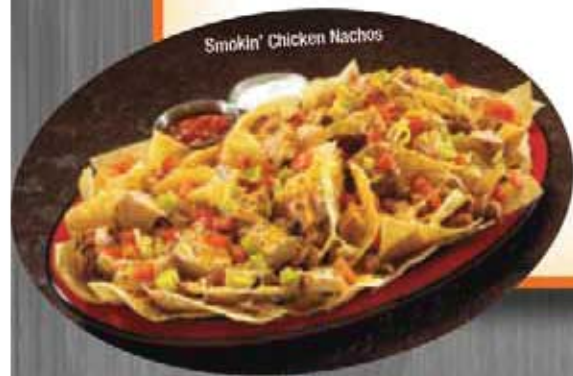
Smokin' Chicken Nachos

Served with your choice of sassy sauces: honey barbecue or our original hot wing sauce, if you're up to it One dozen 6.99 Two dozen 11.99 Each additional dozen 5.00