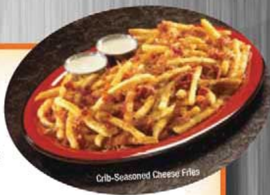
Crib-Seasoned Cheese Fries

Lightly breaded mozzarella cheese and fried mushrooms served on a bed of fries, all ready for a dip in zesty marinara sauce and Ranch dressing. 6.49