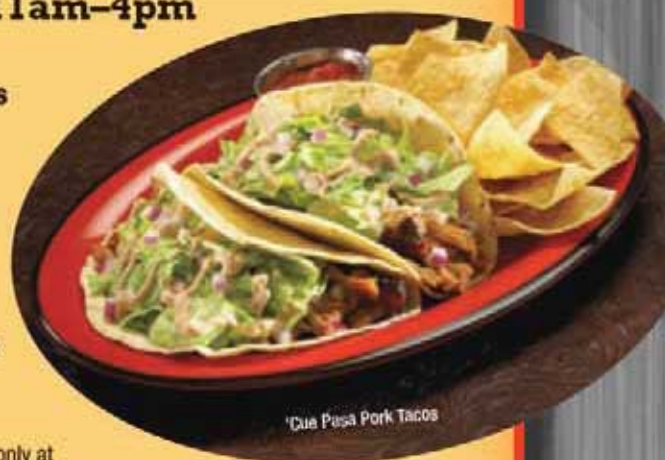
'Cue Pasa Pork Tacos

Two downsized sandwiches, each with your choice of our matchless meats. Comes with one side of your choice. 7.29