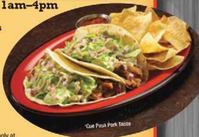
'Cue Pasa Pork Tacos

Two downsized sandwiches, each with your choice of our matchless meats. Comes with one side of your choice. 6.49