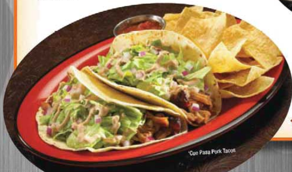
'Cue Pasa Pork Tacos